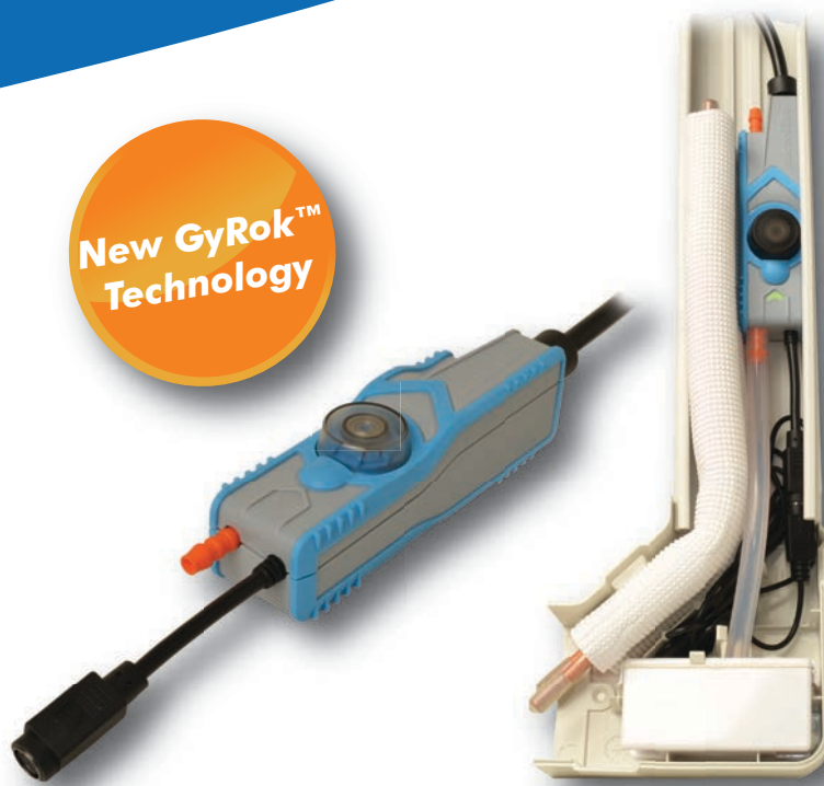
Ducting Kit (X85-507)